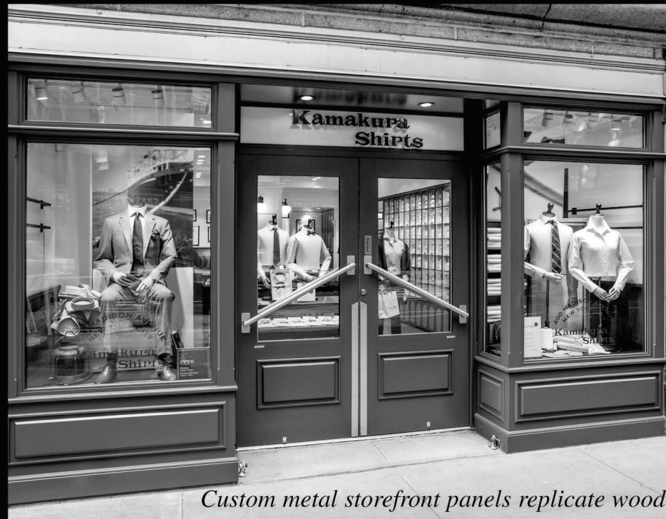
Custom metal storefront panels replicate wood

131-10 Maple Avenue Flushing, NY 11355 www.gamcocorp.com T: 718-359-8833 info@gamcocorp.com